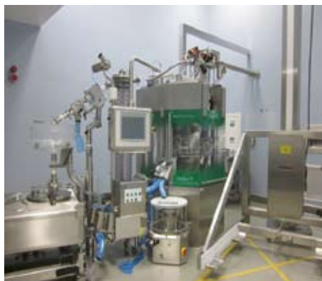
Tablet press and ancillary equipment in one of the dedicated HP suites