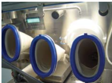
Double chamber isolator and API charge hopper at Alkermes facility

Alkermes' successful approach to commercial-scale final dosage manufacture of drug product containing highly potent API