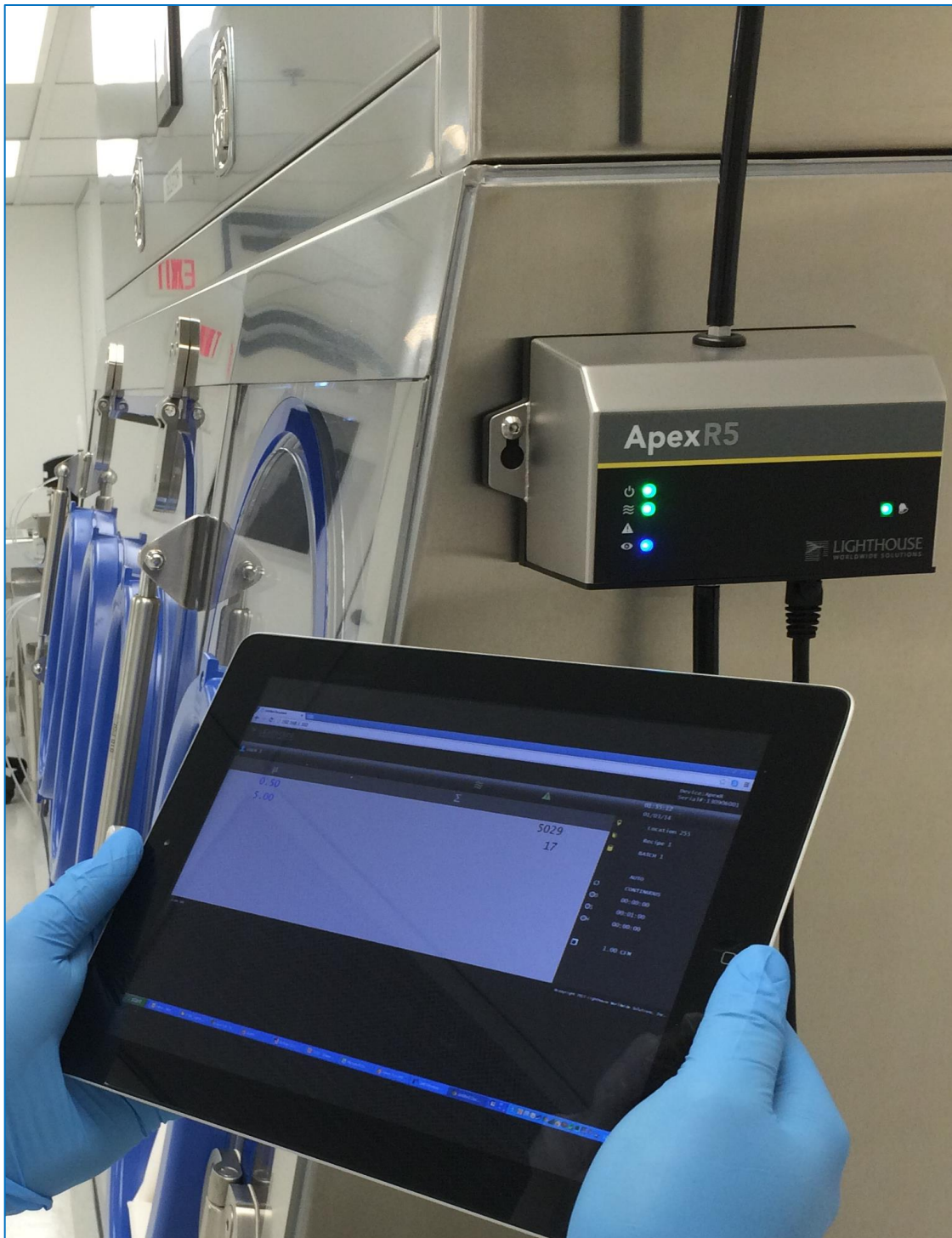
Fig.2 Cleanroom operator connecting to EMS monitoring particle counts inside an isolator