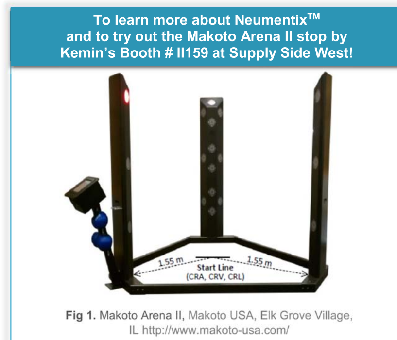
Fig 1. Makoto Arena II, Makoto USA, Elk Grove Village, IL http://www.makoto-usa.com/

For example, millisecond intervals of time can have significant impact on common