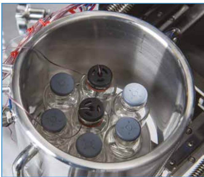
LyoCapsule: 7-vial development freeze dryer

Many new biological drugs are complex formulations with high protein content and high fill volume presenting a significant challenge when freeze-drying. The use of ControlLyo can ensure lower product resistance and homogeneity due to sublimative cooling therefore, enabling more aggressive cycles for products and expanding the design space. The added advantage of ControlLyo is that it can be fitted, or retrofitted, to any freeze dryers.