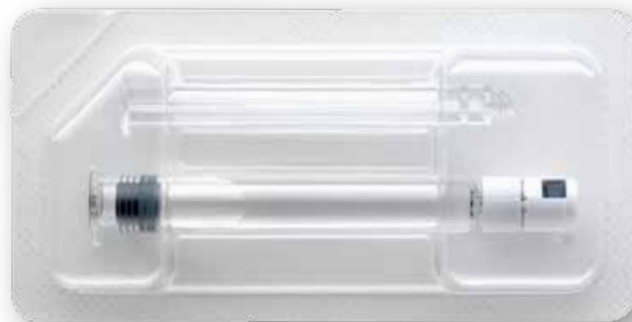
Example: Blistered sWFI-Syringe 3.0 ml