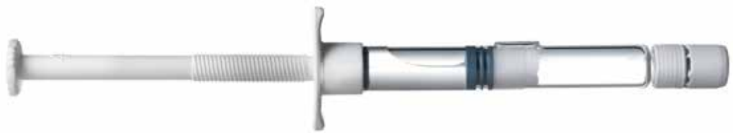
Example: Vetter Lyo-Ject® dual-chamber syringe 1.0 ml

Vetter's patented dual-chamber technology allows different ingredients and solvents to be prefilled and stored separately, then easily mixed and administered as needed. Dual-chamber systems can be used for lyophilized/solvent drugs, liquid/liquid drugs, and powder/liquid drugs, and offer your sensitive compound many advantages.