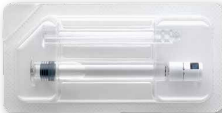
Example: Blistered WFI-Syringe 3.0 ml